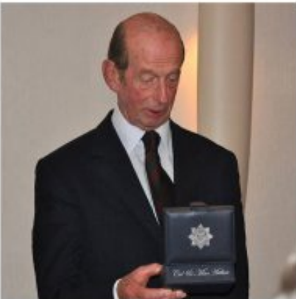
With kind permission from His Royal Highness The Duke of Kent Photographer: Jake Reid